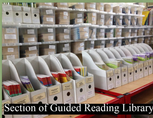
Section of Guided Reading Library

Over the past few years we have worked hard to include as many text books as possible on our book rental scheme thereby alleviating the financial burden on our families. With the cooperation of our Parent's Association and staff, all of our books are covered and in good condition. Worn books are replaced each year. Through this scheme, we are building our resources giving children a far wider range of texts.