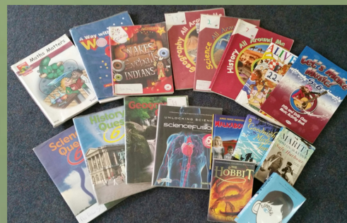
Books available on 6th. class book rental